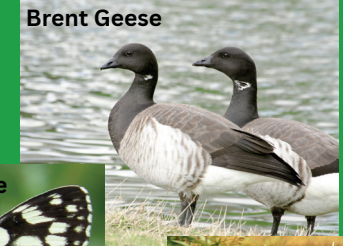
Marbled White Butterfly